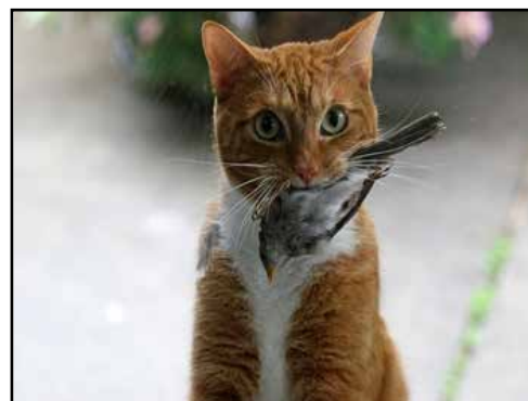
Demise of Wren family

What can we do? Keep cats indoors, at least in spring. If you must let them out, fence your yard. Let our farm and forest ecology partners reproduce. Thanks!