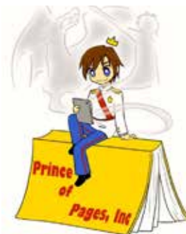
Prince of Pages, Inc. www.princeofpages.com

W-L High School Graduate George Mason University Graduate DeVry University Graduate United States Army Veteran Writer of Adventure Books, Children's Books, Christian Books, Dental Fiction, Poetry, and Young Adult Fiction Longtime resident of Arlington