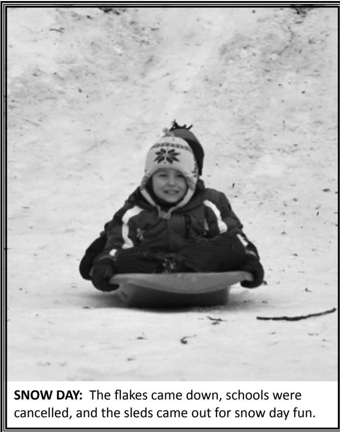
SNOW DAY: The flakes came down, schools were cancelled, and the sleds came out for snow day fun.