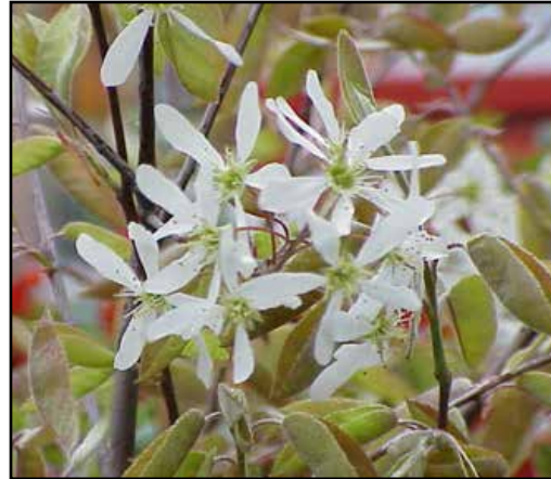
The Arlington officials responsible for our natural areas undoubtedly approved the selections. We can thank them for choosing so many native trees!

Almost as many smaller trees are planned, including familiar varieties from our local woodlands, such as redbud, American holly, and hornbeam (with those smooth sinuous trunks you can see along Lubber Run). Pawpaw is on the list, along with sweetbay, fringetree, and serviceberry.